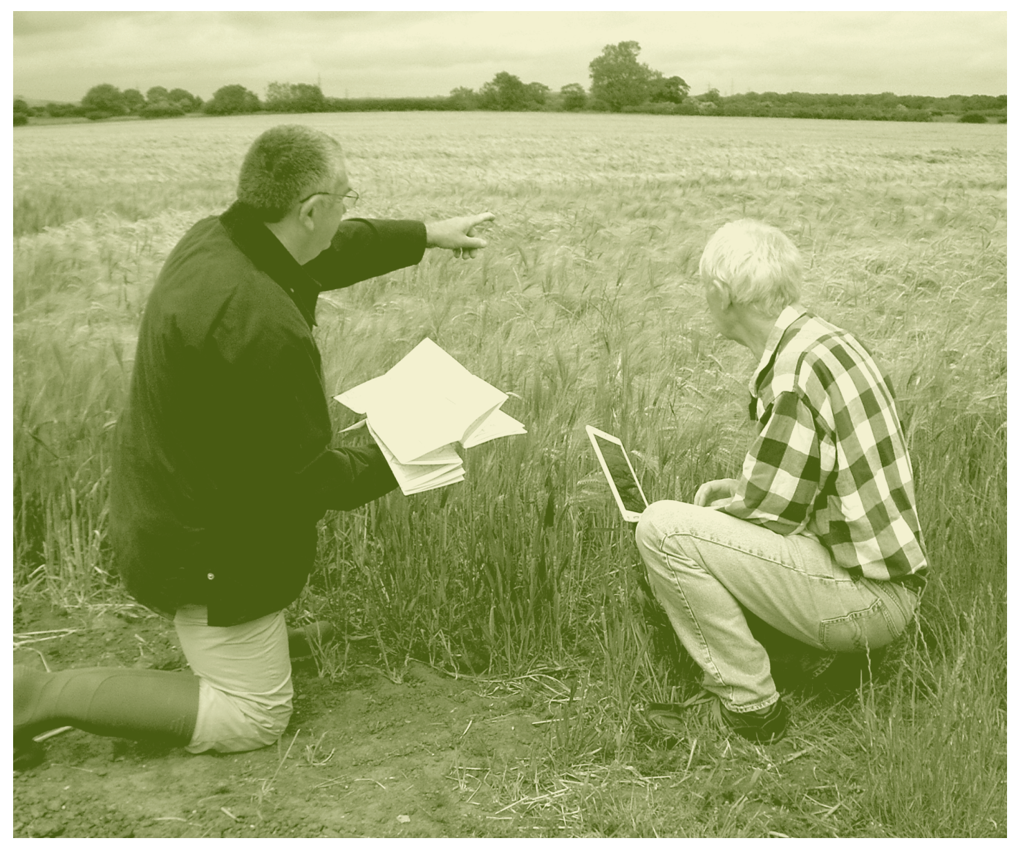
Policy and Practice Notes

A Rural Economy and Land Use project investigating the field expertise of specialist advisors and their role as knowledge brokers between scientific research and land management.